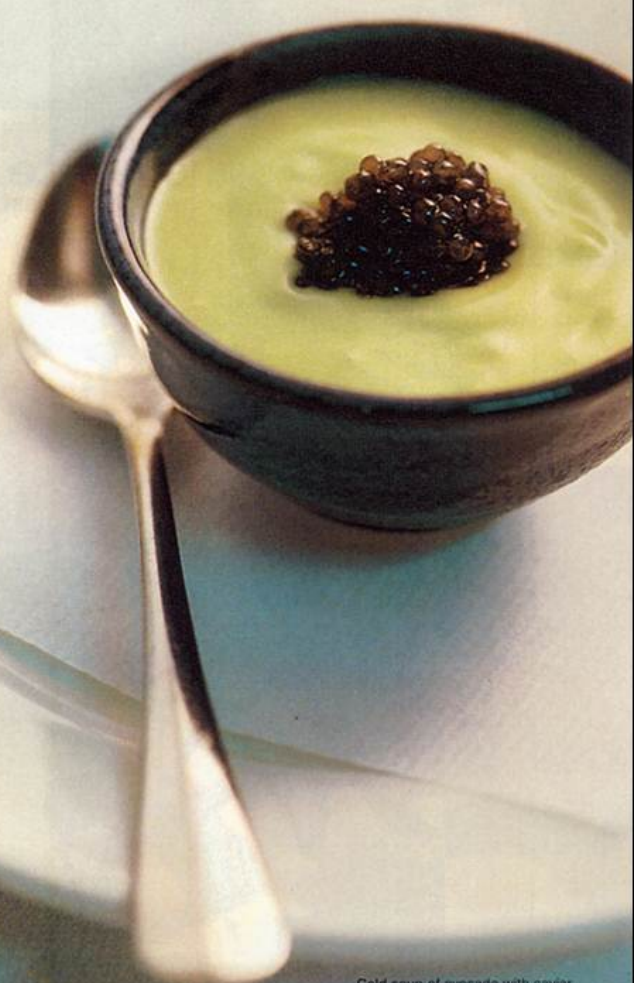
Cold soup of avocado with caviar.

It may have had to share the stage for a night but, once away from Tetsuya's food, it's safe to say the 8810 will never again be taken for granted.